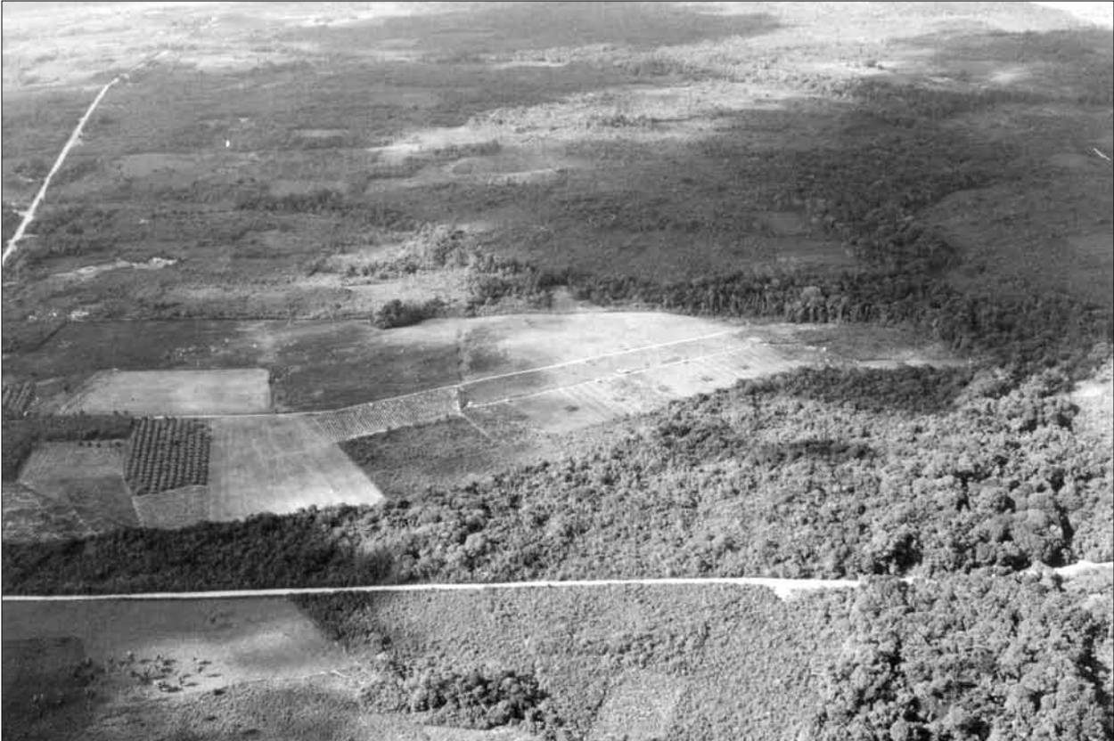
Figure 1. Aerial view to the south on the studied smallholding at Nova Olinda (site 1): the typical rural landscape mosaic of the Bragantina region can be seen which consists of cassava fields, pastures, gardens, and capoeira. Around the Pupuca creek (right hand) dense gallery forests (igapó) can be seen, which turn into approximately 13 years old capoeiras further left (e.g. broad forest stripe behind road). At the centre of the photo, the pasture experiment of the SHIFT-project with its six dark capoeira spots is visible. The road on the left hand is the 'estrada velha Igarapé-Açu – Maracanã, PA-426', at km 9. The road at the bottom is the travessa 9. Photo: Wickel & Vielhauer, 15 April 2000.

Daily checklists of site 1 were evaluated for abundance and frequency of each species. According to the frequency, species were categorized sensu Novaes & Lima (1992) namely as: abundant (present in > 80% of the days), common (61-80%), regular (41-60%), occasional (20-40%), and rare (< 20%). Bird records were also evaluated for wet (January-June) and dry season (July-December). Taxonomy follows Pacheco et al. (2007) and CBRO (2008), while assessment of species vulnerability follows Stattersfield & Capper (2000). The total species number is calculated by adding all species of Table 1 to the free-living species mentioned in the text.