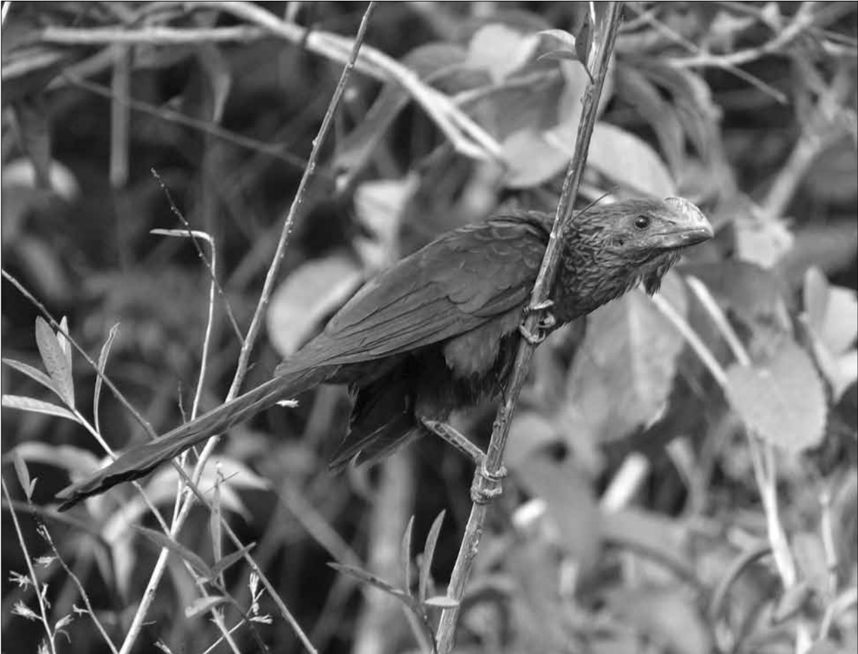
Figure 2. Smooth-billed Ani ( Crotophaga ani ) is the most common character bird species of the mosaic-like rural landscape in Igarapé-Açu municipality.

due to their limited observation times. Also, Crotophaga ani and Columbina passerina seem to be much more common in Igarapé-Açu than in Vigia. The main differences can be explained by the different survey methods, slightly different habitats, e.g. pure capoeiras, savannas, mangroves in contrast to a rural landscape mosaic, and different study times.